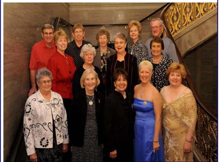
GFWC/Iowa well represented at GFWC Convention 2009

If you are a department or special chairman and want information added to your web page, send a message to gfwciowa@aol.com. 2009 State Convention winners, Scholarship winners and newsletters are some of the items you can find on the website. The 2009 State Convention pictures will be uploaded soon!