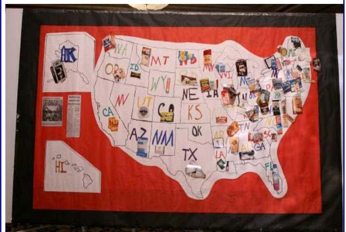
GFWC Convention Patriotic Day display showed what each state contributed to our military in Iraq and Afghanistan